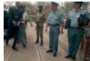
Jean Paul Akayesu is escorted to the Rwandan War Crimes Tribunal in Arusha