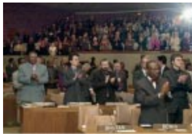
Applause for the entry into force of the Rome Statute