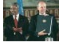
Holding up the Rome Statute