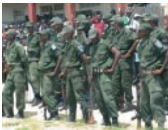
Ituri Peace Force