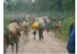
Refugees flee Ituri