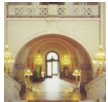
...reception at the entrance hall of the Peace Palace...