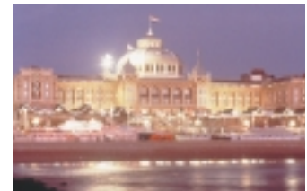
...Joint dinner in the Kurhaus...